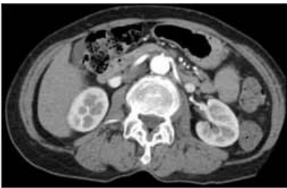
CT image showing internal body structures

Both CT and conventional x-rays take pictures of internal body structures. In conventional x-rays, the structures overlap. For example, the ribs overlay the lung and heart. In an x-ray, structures of medical concern are often obscured by other organs or bones, making diagnosis difficult.