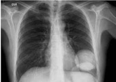
X-ray image showing internal body structures

Both CT and conventional x-rays take pictures of internal body structures. In conventional x-rays, the structures overlap. For example, the ribs overlay the lung and heart. In an x-ray, structures of medical concern are often obscured by other organs or bones, making diagnosis difficult.